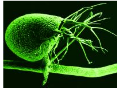
IMAGE: A scanning electron micrograph shows the bladder of Utricularia gibba , the humped bladderwort plant (color added). The plant is a voracious carnivore, with its tiny, 1-millimeter-long bladders leveraging vacuum pressure...

"The big story is that only 3 percent of the bladderwort's genetic material is so-called 'junk' DNA," Albert said. "Somehow, this plant has purged most of what makes up plant genomes. What that says is that you can have a perfectly good multicellular plant with lots of different cells, organs, tissue types and flowers, and you can do it without the junk. Junk is not needed."