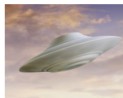
Air Force Seems Unsure Of Reported UFO - HuffPost Live