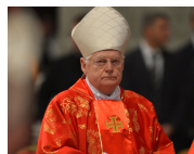
Anti-Mafia Police Raid Home Of Papal Frontrunner - HuffPost Live