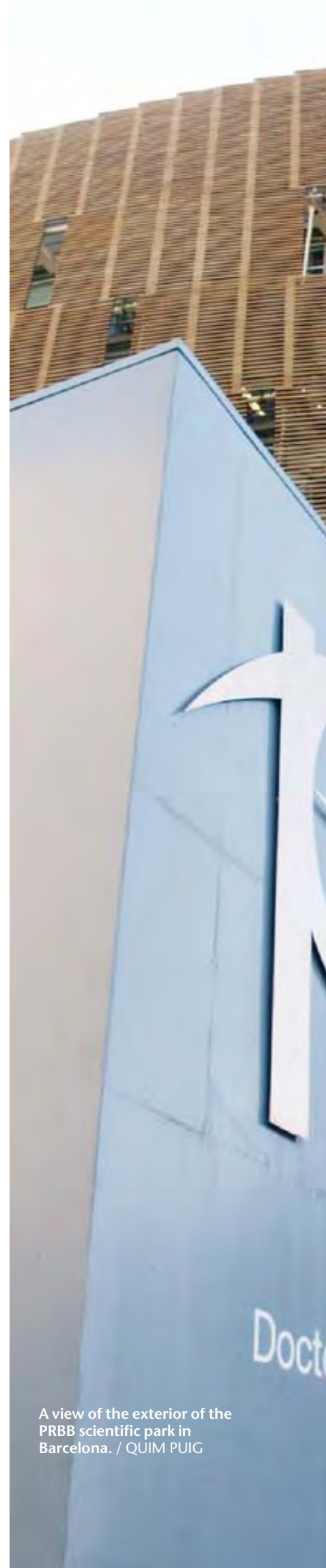
A view of the exterior of the PRBB scientific park in Barcelona.

While the various research centres are mostly independent of each other, they do share key scientific and technical services offered by the park, such as the animal facility, as well as tech-