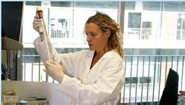
Brightly-lit laboratories. The windowed façade of the Parc de Recerca Biomèdica allows plenty of natural light into the different laboratories spread over the building's nine storeys.