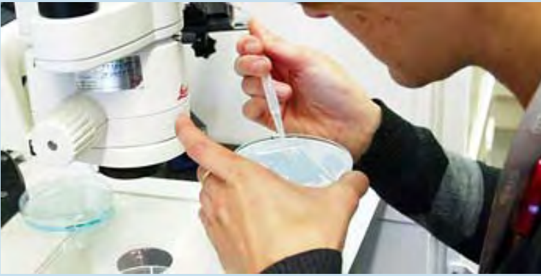
From the smallest to the largest. The work that takes place in the scientific park is both on the molecular level, such as the study of cells, and the global level, with research into such things as epidemiology or public health.