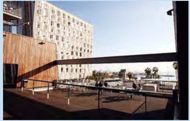
Research on the seafloor. The PRBB staff work in a privileged environment, in a state-of-the-art building, in front of the Barceloneta beach. / ORIOL DURAN